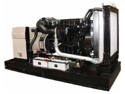
KV300U Shown; KV350 is Similar