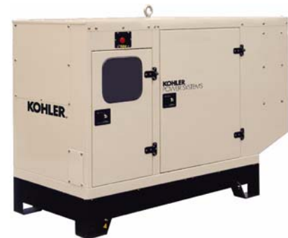
With Available Enclosure Accessory

RATINGS: All three-phase units are rated at 0.8 power factor. See TIB-109 for generator set derate tables. Obtain the technical information bulletin (TIB-101) on ratings guidelines for the complete ratings definitions.